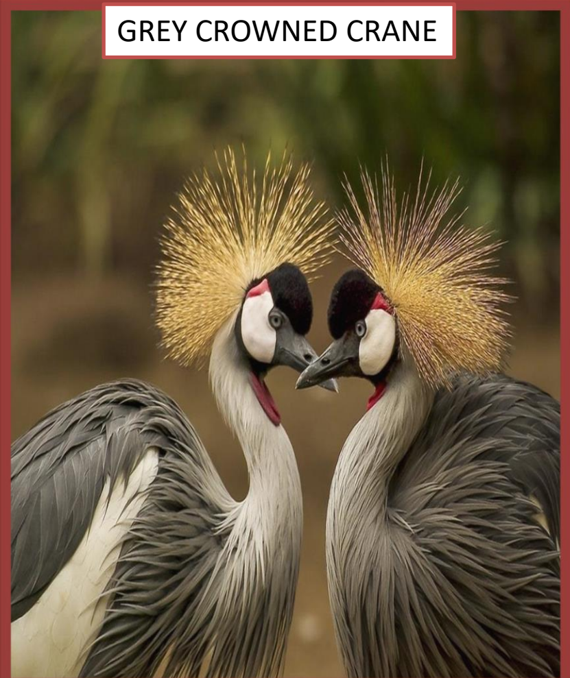
GREY CROWNED CRANE