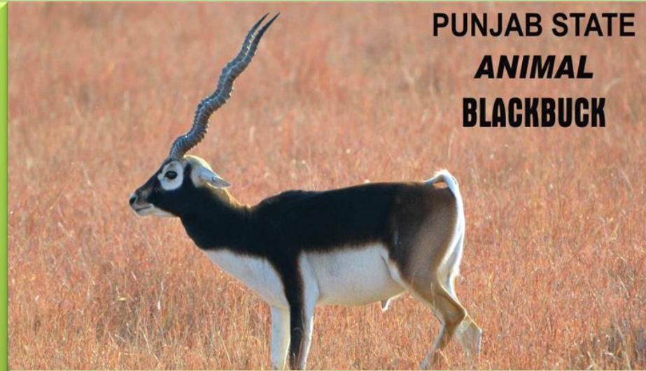
PUNJAB STATE ANIMAL BLACKBUCK