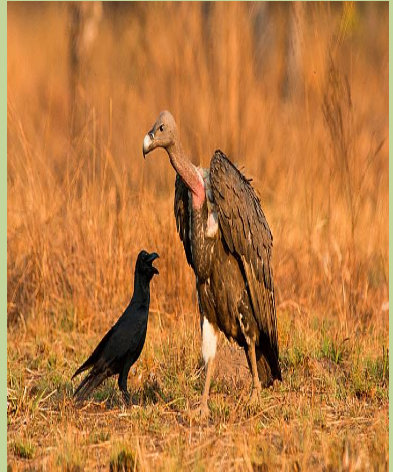
White-backed Vulture Critically Endangered Bird Of Punjab